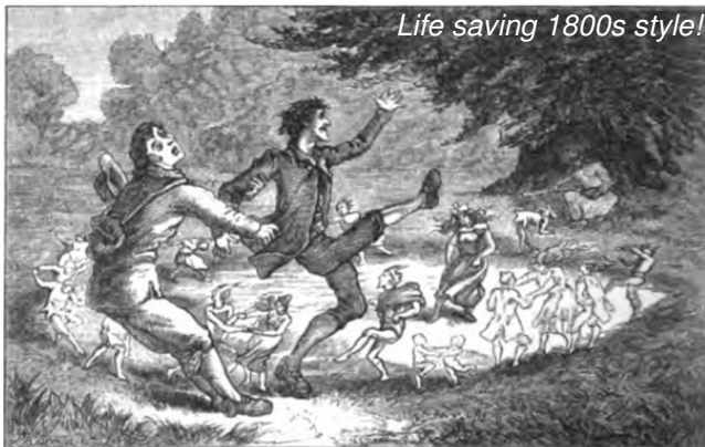
Life saving 1800s style!

making any suggestions or recommendations regarding cooking. Many people do however collect their own fungi and these people are known as mycophagists although this term can also relate to those who simply eat mushrooms. So, if you intend to collect your own for consumption then make sure you know your onions (or in this case: mushrooms)! I do not collect them but I do remember one species known as 'Common Chanterelle' that appeared on the lawn