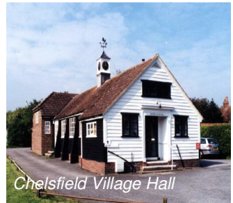
Chelsfield Village Hall