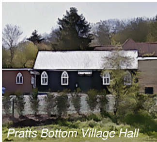
Pratts Bottom Village Hall

"Kent did us proud, it was a fabulous location for our shoot."