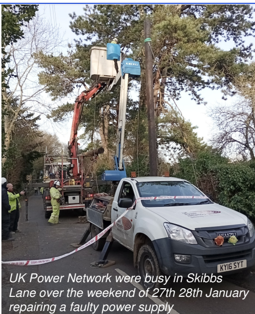
UK Power Network were busy in Skibbs Lane over the weekend of 27th 28th January repairing a faulty power supply