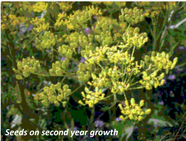
Seeds on second year growth

The parsnip is native to Eurasia and was used by the Romans and even earlier although there is some confusion in the literature as wild carrots (used in ancient farming) were of a similar off white colour to parsnips. Before the arrival of cane sugar, parsnips were used as a culinary sweetener and took the place of potatoes on the British dinner table prior to that vegetables' discovery by the Spanish in South America (despite the old wives tale it would have been impossible for Walter Raleigh to have discovered the potato at