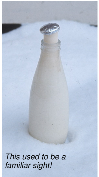
This used to be a familiar sight!

insulated loft! However, despite the near certainty of a dollop, as dad would say, we seemed to get by OK. Schools never closed and us children walked there as we usually did each day, dad got to work at Blackheath by car, most trains ran, if a bit late (mind you steam and diesel locomotives were far less likely to be beaten). Milk and bread seemed to get delivered, as long as you didn't leave the milk too long on the doorstep to freeze solid!