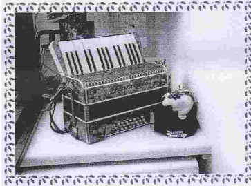
My dad's original accordion A 'Francesco Modello' circa 1930, 24 base. Saxony.