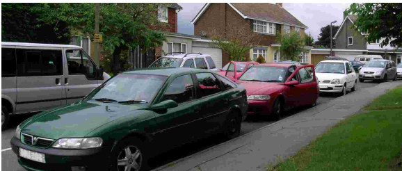
Access for Emergency Services?