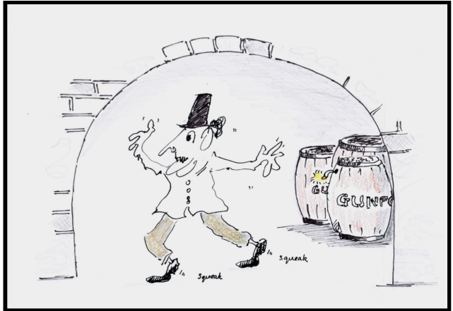
The plot to blow up Parliament, (A plan some felt was heaven-sent) Was foiled for Guy, who with regret Bought crummy shoes from Internet