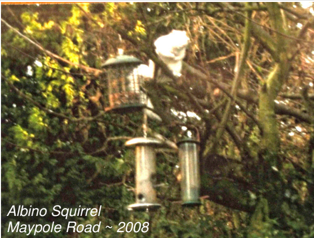
Albino Squirrel Maypole Road ~ 2008

This month I've decided to write about an animal that's familiar to us all: the squirrel ( Sciurus carolinensis ). More correctly, this Latin name refers to the Eastern Grey Squirrel which was introduced into Britain and has largely displaced the indigenous red squirrel ( Sciurus vulgaris ). The grey squirrel's Latin name sciurus derives from two Greek words meaning shadow and tail while the specific epithet Carolinensis refers to the Carolinas in the US where the species was first recorded. During Victorian times there was a trend to 'enrich' the unsatisfactory native fauna and as a result of this trend the grey squirrel was introduced at least 30 times between the 1870's and the 1920's. It seems that a disease carried by the greys is lethal to the red variety of the squirrel and hence the red's number have dwindled ever since.. Locally it must be many years since a red squirrel was seen around the village but only a couple of years ago an albino