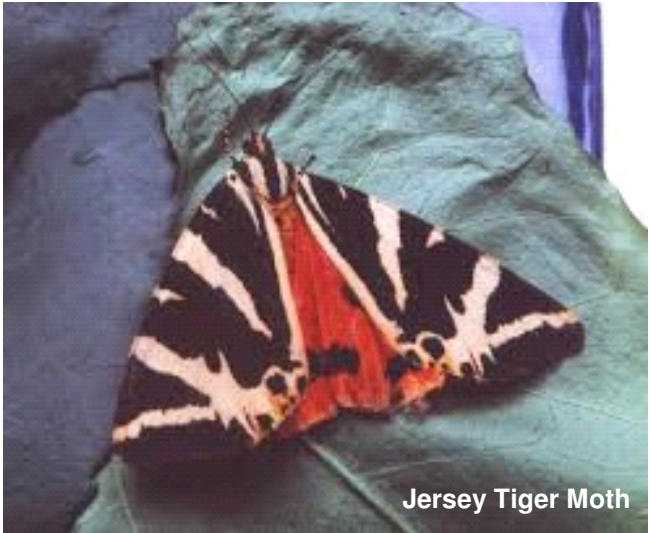
Jersey Tiger Moth

Both of the wheat varieties seemed to cope with the dry much better and we have had a good crop. This year we grew, what we call biscuit wheat and all the various criteria was met. It gets a bit technical regarding proteins, moisture and hagerbergs targets but I won't bore you with all of that. The heavy rainfall on the Wednesday in the middle of August washed quite a lot of goodness from the wheat but it still made the grade. We won't talk too much about the peas because they were a ..... disaster. What with the dry spring, late frost and pigeons, the crop didn't really stand a chance. 2" of