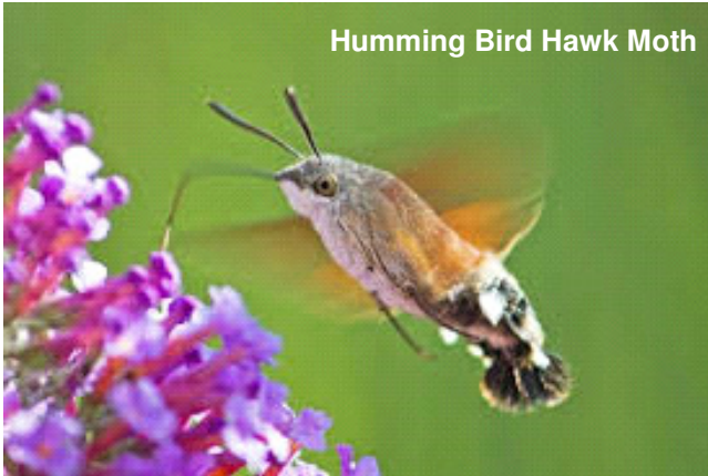
Humming Bird Hawk Moth