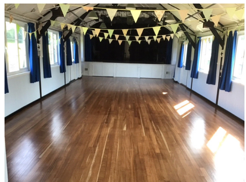
between the 'original' floor and the cleaned surface.

The first image shows the difference in colour