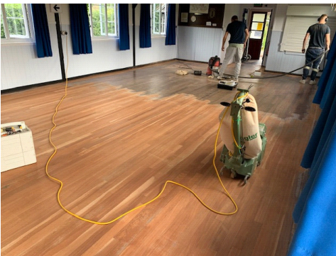
The wooden floor in the Village Hall has recently been refurbished.

The first image shows the difference in colour